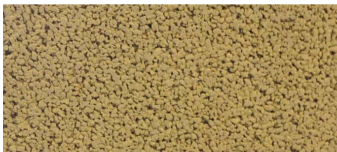
GIALLO - Cod. 11