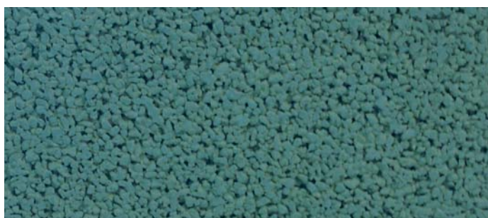
VERDE - Cod. 04