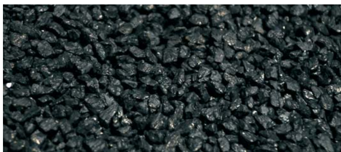
NERO - Cod. 09