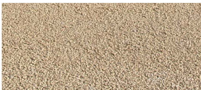
OCRA TENUE - Cod. 06